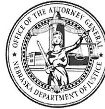
JON BRUNING ATTORNEY GENERAL